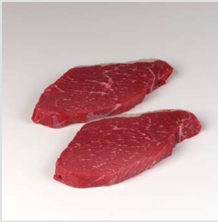
5. Cut silverside muscle into steaks.