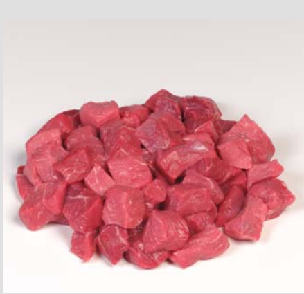
5. Cut silverside muscle into dice.