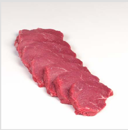
9. “Premium” Bistro Rump Steaks.