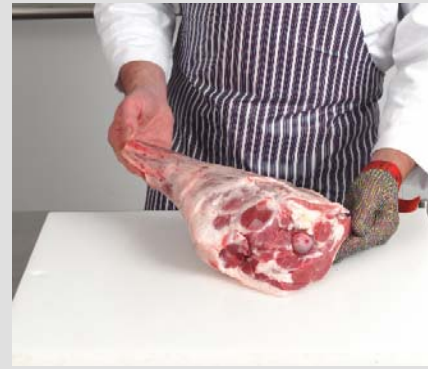
11. Carving leg – internal view.