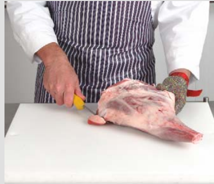
10. Trim off excess fat.