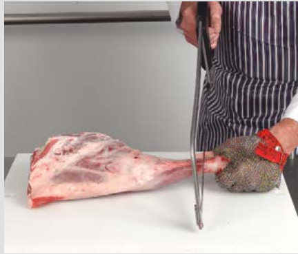
9. Remove knuckle bone.