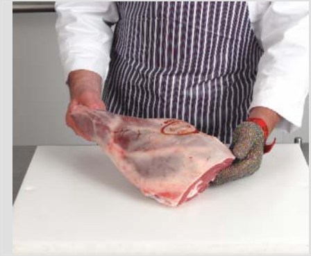
12. Carving leg – external view.