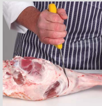
3. Separate the shank from the leg by cutting through the joint.