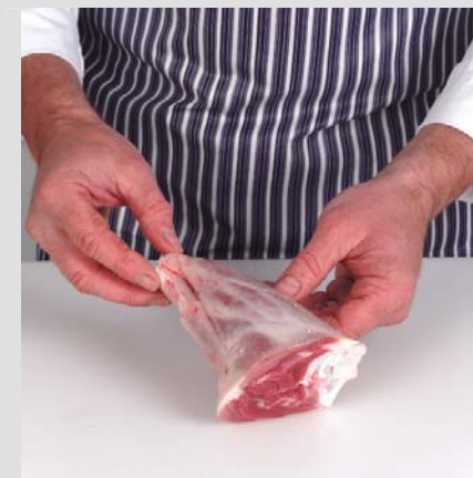
4. The prepared shank.