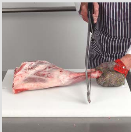
2. Remove the end of the knuckle bone as illustrated.