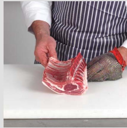
3. Remove the rib section of the loin.