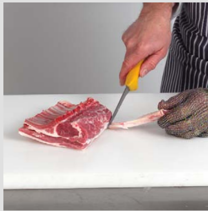
6. Remove the thick yellow gristle.