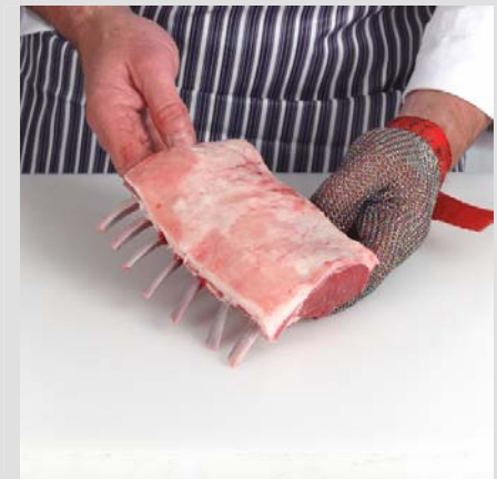
8. Rack prepared and ready for sale.