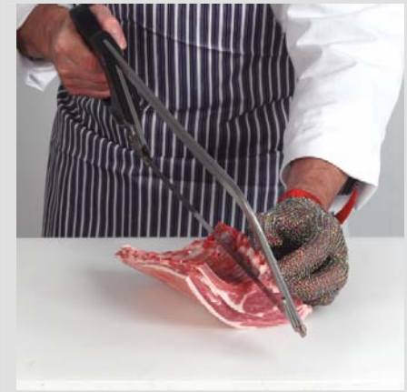
4. Carefully saw through the rib bones close to the backbone.