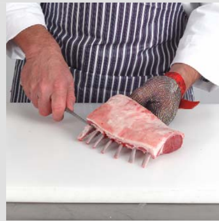
7. French trim the ribs to leave 50mm of bone exposed.