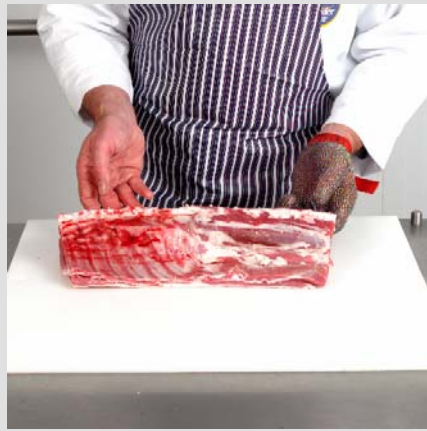
2. Loin of lamb. Loin tail to be 1\frac{1}{2} times the length of the eye muscle.