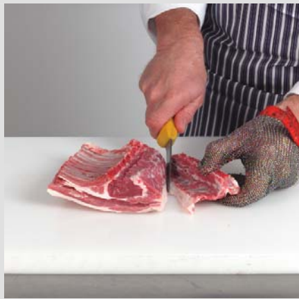
5. Then remove the backbone.