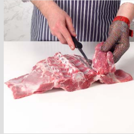
3. Remove both fillet muscles.