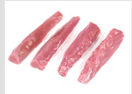
4. Trim fillets of all fat and connective tissue.