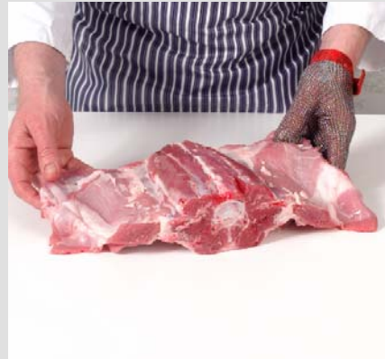
2. Bone-in saddle