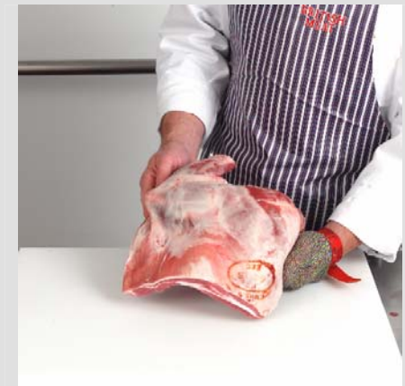
8. External view of prepared shoulder.