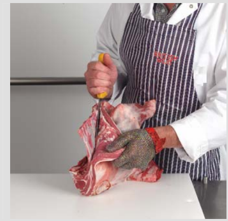
4. Sheet bone the ribs and backbone taking care not to cut into the underlying muscles.