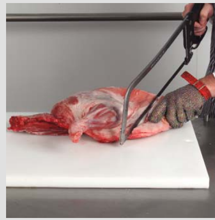
3. Remove the tip of the breast.