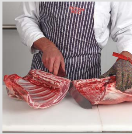
2. Remove the forequarter from the carcass by cutting between the 6 th and 7 th ribs.