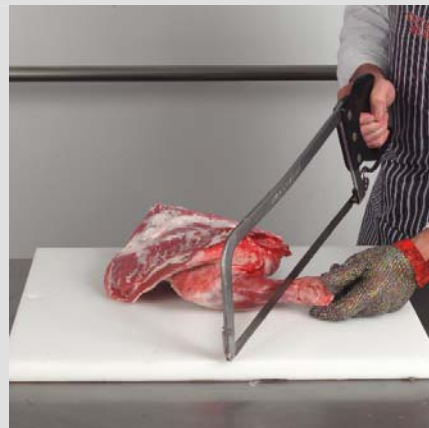
6. Remove the knuckle as illustrated.