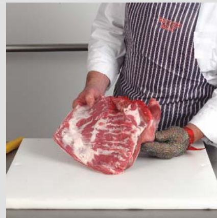
7. Internal view of prepared shoulder.