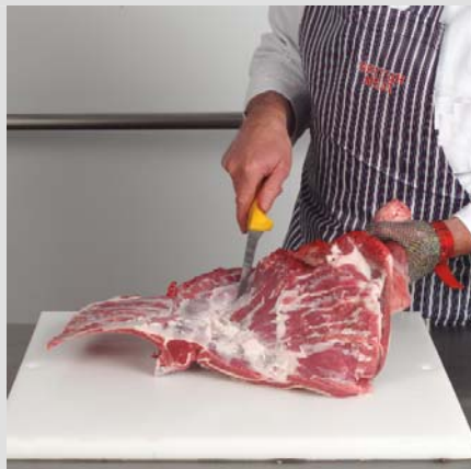
5. Leave the neck fillet attached to the neck bones.