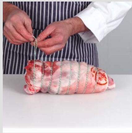
6. Roll and tie joint securely with string at regular intervals.