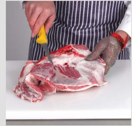
4. Carefully remove blade and shoulder bones.