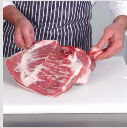
2. Shoulder of lamb.