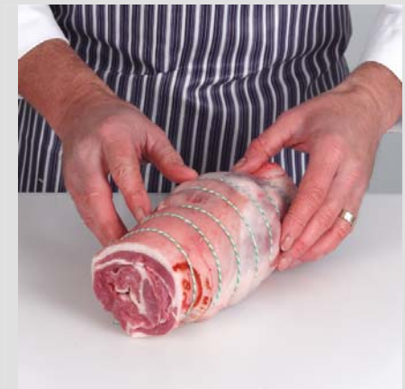
8. Boned and rolled shoulder, ready for sale.