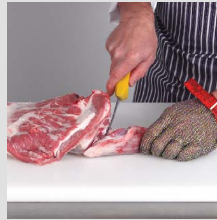
3. Remove knuckle by cutting through the joint.