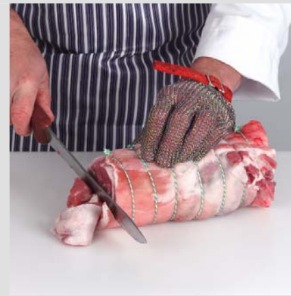
7. Trim both ends.