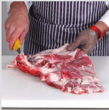
5. Remove excess fat deposits.