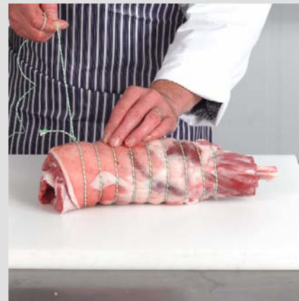
7. Roll and tie securely with string at regular intervals.