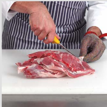
6. Trim off any excess fat.