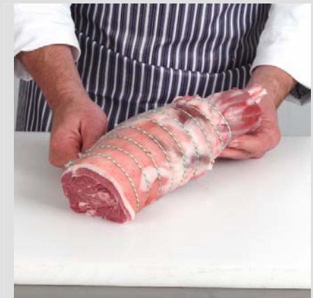
8. Carvery roast (shoulder).