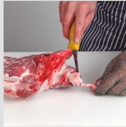
3. French trim the knuckle to expose 25mm of clean bone.