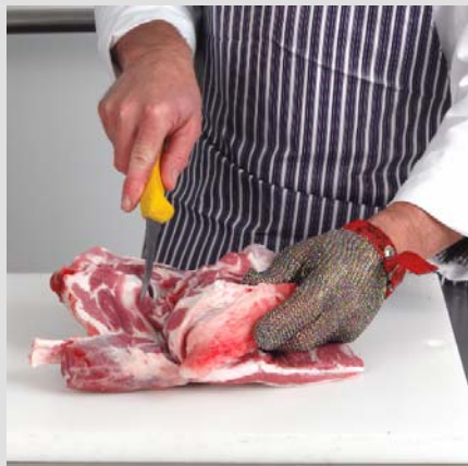
5. and humerus but leave the knuckle intact.